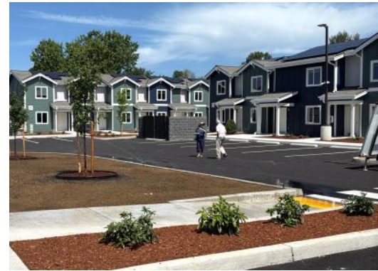
The 40-unit Sunrise Village development